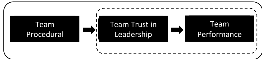
Figure Note. Solid outline represents mediation model in HI . Dotted outline represents direct effects

Hypothesized Relationships between Team Procedural, Team Trust, and Team Performance