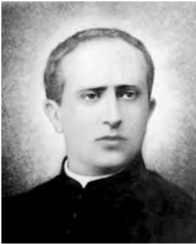
St Jose Maria de Yermo y Parres

San Jose Maria Yermo Parres knew how to live his life. He understood that Holiness is a life long task. The saints teach us that it is possible to live the Gospel fully, and that the message of Jesus is current and demanding today. Father Yermo, a Mexican priest, forged his holiness in the service of the poor under the charism of St. Vincent De Paul.