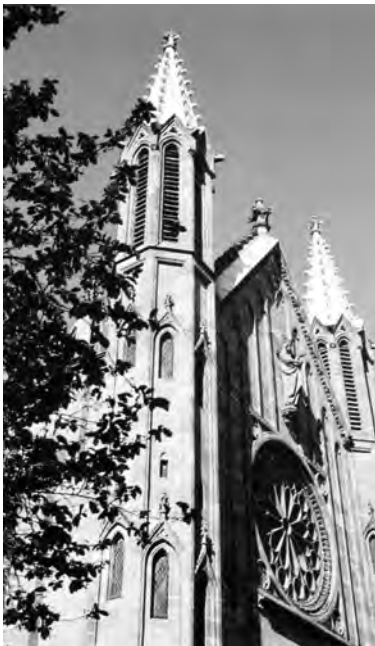
Motherhouse and Chapel of Tousain Street