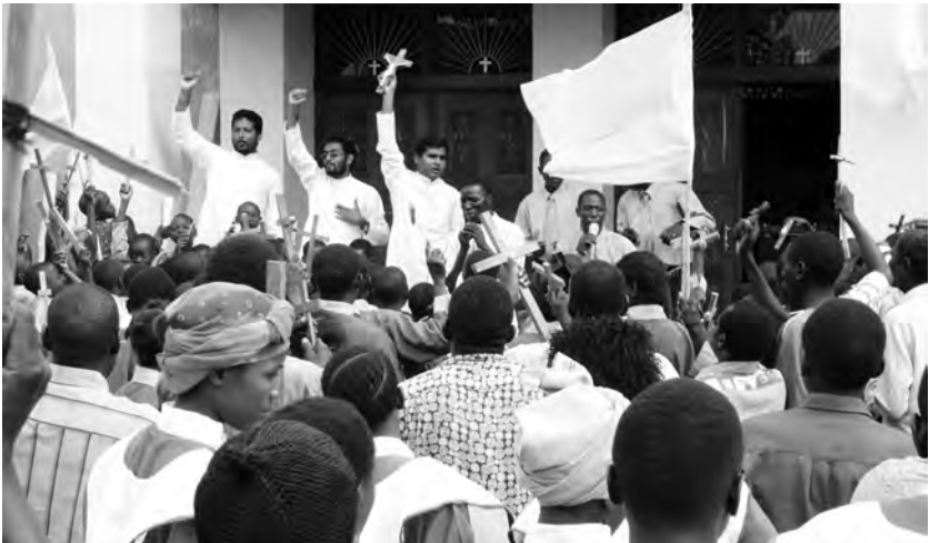
Popular Mission in Kerala

The people come to the center in the morning and evening only in jathas (processions), not singly. For each jatha, there will be a leader who will carry a big papal flag in the front. When the jatha reaches the center, the flag is kept in a prominent place and noting the number of the flags the director can ascertain whether all the groups have come or not. The jatha has a great influence in bringing the people to the center. Once a mission was conducted in a big parish. One man was away for a few days and he had no knowledge of the mission. The first day at about midnight he returned home and went to sleep. At about 4 a.m. he heard the sound of cannons and firecrackers, and knowing not what it meant and being curious, he got up and watched what was happening. He wanted to know where the people were going in procession and so he followed the jatha. Following them he reached the church and he found something special about the whole process, which led him to attend the mission in full; and he was very much thrilled with joy and peace. Afterwards he said that the jathas should be kept, at any cost, in the popular mission and should never be abandoned.