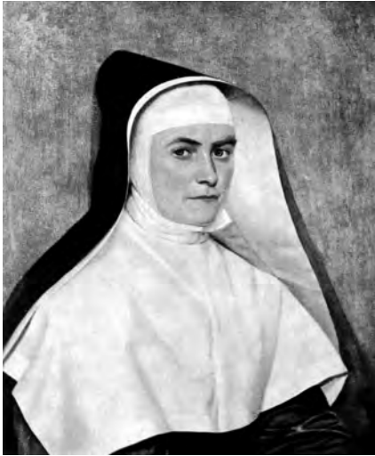
St Joan Antide Thouret

Joan Antide Thouret was born in the little village of Sancey, in the diocese of Besançon, in Franche-Comté, on 27 November 1765, into a deeply Christian family. At a very early age “she felt a strong attraction to the stricter religious life and at the same time to the service of the poor.” 2 She was directed towards the Daughters of Charity, and to join them she “was ready for everything, even to go to the end of the earth.” 3 During her time as a postulant in Langres, not far from her native village, she had her first “encounter” with St Vincent de Paul, the start of her daughter-like relationship with him, whom