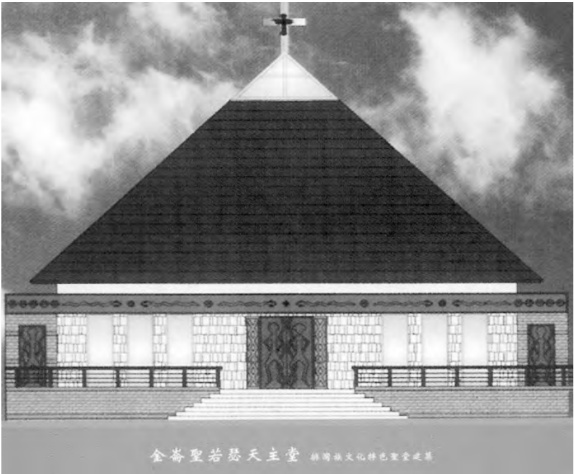
Church of the CM in Taiwan

The last visit was with a confrere, 92 years old. After his release from prison he returned to his home village where he began to celebrate the Eucharist in his family's home. He did so for many, many years without any difficulty, for the most part, from the government. We arrived at the village, in the middle of farmland,