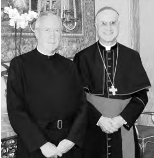
Superior General of the Brothers of Charity with Cardinal Bertone, Secretary of State