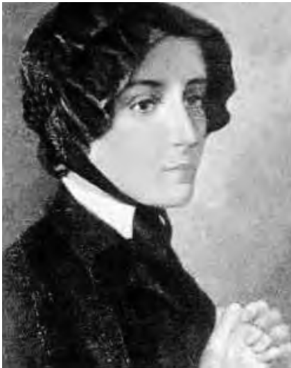
St Elizabeth Ann Bayley Seton

In the closing decades of the 18 th century and the beginning of the 19 th , a series of events occurred that would dramatically change the course of Catholicism in the United States, allowing it to take root and flourish. Indeed, in time, the history of the new republic would become inextricably intertwined not only with the American Church, but with the American expression of a congregation of Charity founded in France centuries before.