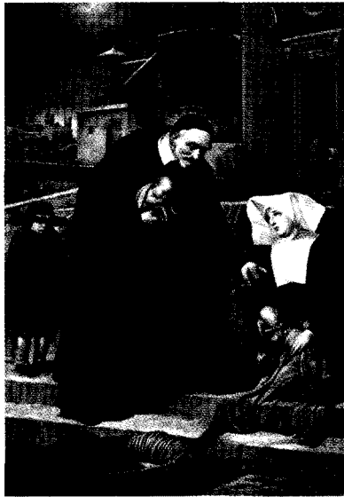
Period painting of Vincent de Paul and the Daughters of Charity aiding those in need.

The Châtillon story, brief as it is, bears careful scrutiny. It is important in understanding the link between Vincent the inspiring preacher and personal caregiver, and the Vincentian family of organizations devoted to the same mission nearly four centuries later. What really happened at Châtillon, and why can it be considered as paradigmatic for Vincent's approach to the organization of charity?