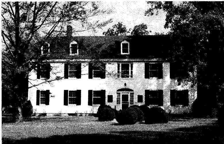
The White House, St. Joseph's Valley. Mother Seton's home from 1810 until her death in 1821.