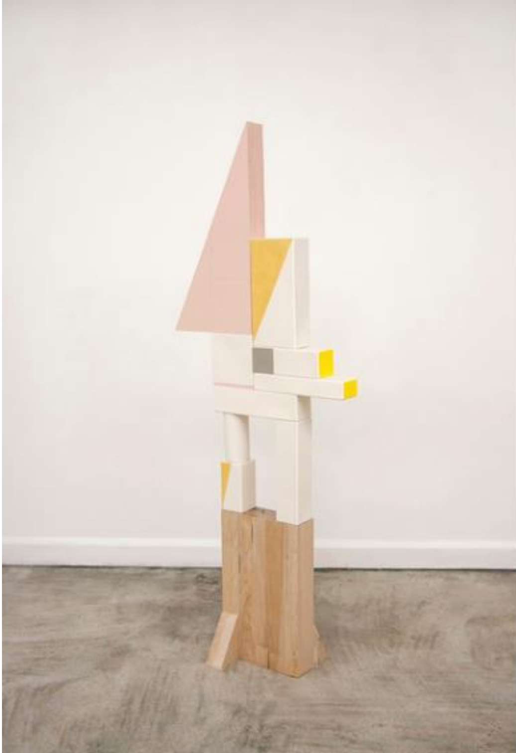
Porcelain, glaze, underglaze, foam, wood, acrylic paint 12"x48"x6"