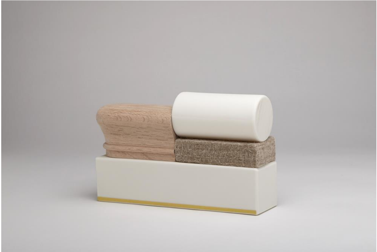
Porcelain, underglaze, glaze, wood, wool felt 5"x8"x2"