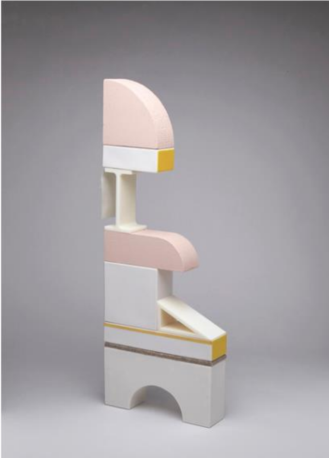
Porcelain, Glaze, Underglaze, Silk, Wool felt, 3d printed plastic, Foam, acrylic paint 8"x15"x2"