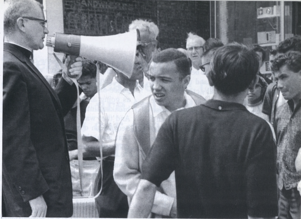
Priest appeals to mob to disperse and go home. June 14, 1966