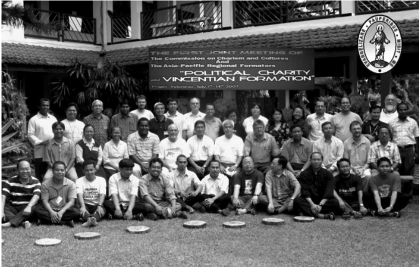
Participants in the gathering at Prigen