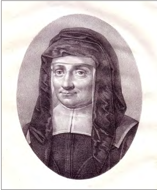
Etching of Louise de Marillac.