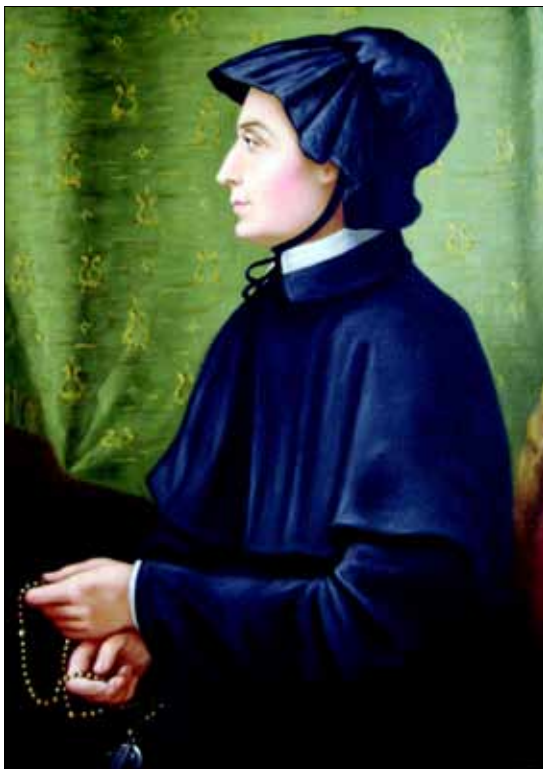
The Filicchi portrait of Elizabeth Seton, circa 1804.

Elizabeth later recalled an incident as a teenager in the year 1789 when her father was in England, perhaps even dead. Jumping into a wagon that was driving into the woods, she set off by herself, and coming upon a meadow she found a sweet bed of rich moss under a warm sun. Surrounded by the sounds of spring and the smells of the wild flowers, she remembered, “I thought at that time my Father did not care for me — well God was my Father — my All. I prayed — sung hymns, cried — laughed in talking to myself of how far he could place me above all Sorrow — Then laid still to enjoy the Heavenly Peace that came over my Soul.” Feeling a deep security that God would never forsake her, she realized: “God was my Father and I quite independent of whatever might happen.” 5 Years later, confined in quarantine in Italy, Elizabeth recalled this incident and thrilled again at the “Heavenly Peace” that came over her and “felt so peaceable a heart — so