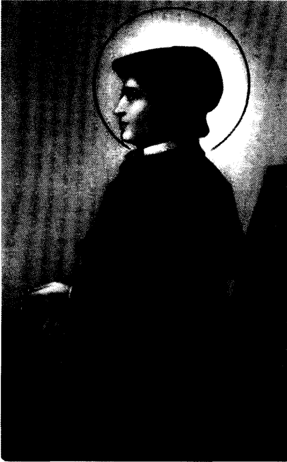
Holy Card of St. Elizabeth Seton. Public domain

rist? Am I not washed in His Blood in the Sacrament of Penance and do I not hope to die prepared by the Sacred Unction which opens heaven to us as we quit the earth — 3