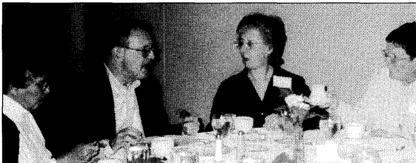
The Saturday evening banquet, marking the end of the event and offering a final chance to meet and reflect.