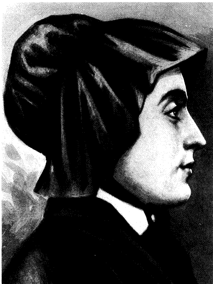
Mother Seton

The Way is nameless because it is the absolute reality which cannot be defined in human language even though it is the origin of heaven and earth. At the same time it has a name as the mother of all things because its power is manifested as the innate nurturing principle of order. In other words, the Tao is the Taoist interpretation of the traditional Chinese notion of High God, Heaven, or the Lord of Heaven, who gave birth to the multitude of people. Since the sage in Lao Tzu always follows the Tao, the three treasures of Lao Tzu are, in fact, the qualities of the Tao.