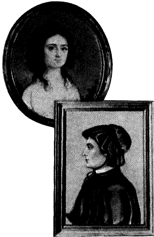
Elizabeth Ann Bayley, Engagement Miniature. Sisters of Charity of Saint Vincent de Paul, New York Mother Seton, Foundress. The National Shrine of Saint Elizabeth Ann Seton, Emmitsburg