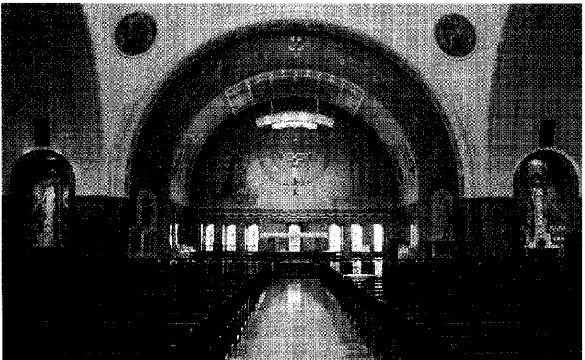
Main Altar, Basilica of the National Shrine of Saint Elizabeth Ann Seton. Emmitsburg, Maryland