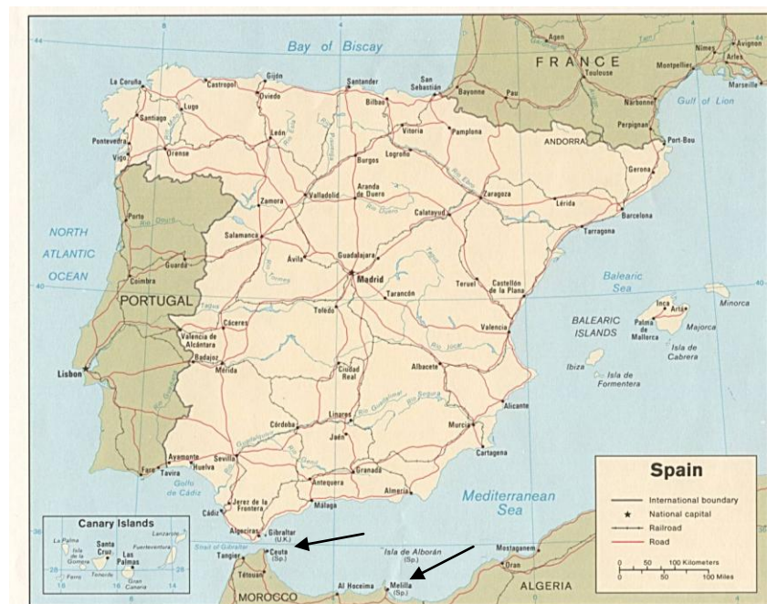
Map 2 - Spain (with Ceuta and Melilla enclaves)

Following on the footsteps of the previous chapter, this section outlines national immigration laws and legalization acts introduced by the Spanish government in the period 1985-2010. First, I focus on legal documents, which are divided into three time periods: the 1980s, the 1990s, and the 2000s. Similarly to my chapter on the EU policy developments, I follow each subsection by a summary of activities undertaken in each decade. My objective is to shed light on Spain's alignment with EU objectives and the degree of influence that the EU has exercised on the Spanish government since the mid-1980s.