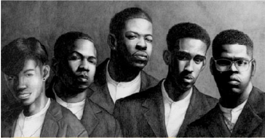
Title: Me & Boyz II Men