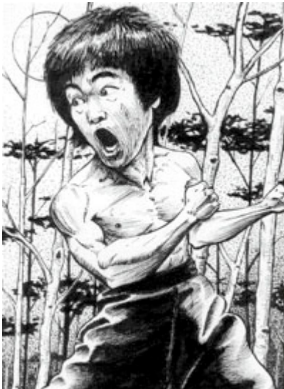
Title: Bruce Lee Graphite drawn picture Caricature of actor/martial artist Bruce Lee