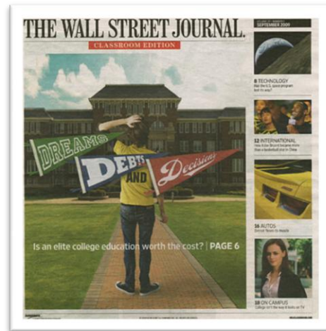
Figure 2: Cover of The Wall Street Journal Classroom Edition Featuring Article on College Decisions

Source: The Wall Street Journal Classroom Edition , September 2009: 1.