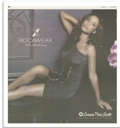
Figure 7: Carson Pirie Scott Advertisement Featuring Rocawear Brand Clothing