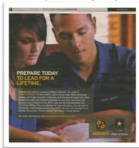
Figure 9: Advertisement for U.S. Army ROTC Depicting Male Assisting Female