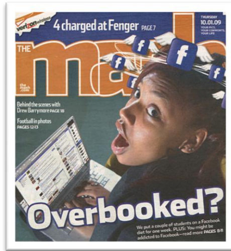
Figure 3: Cover of TheMash Featuring Article on Overuse of Facebook

covers up half of the title bar at the top of the page so that the “a,” “s,” and “h” in the words “the” and “mash” are not visible.