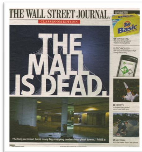
Figure 1: Cover of The Wall Street Journal Classroom Edition Featuring Article on Malls

Source: The Wall Street Journal Classroom Edition , October 2009: 1.