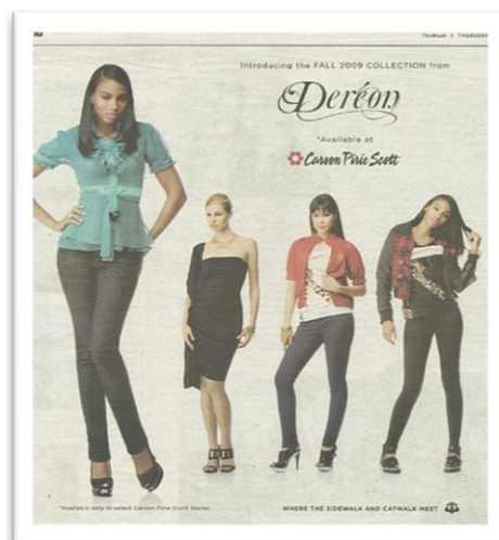
Figure 5: Carson Pirie Scott Advertisement Featuring Deréon Brand Clothing