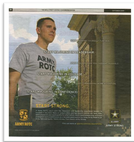
Figure 8: Advertisement for U.S. Army ROTC Depicting Male Student At School