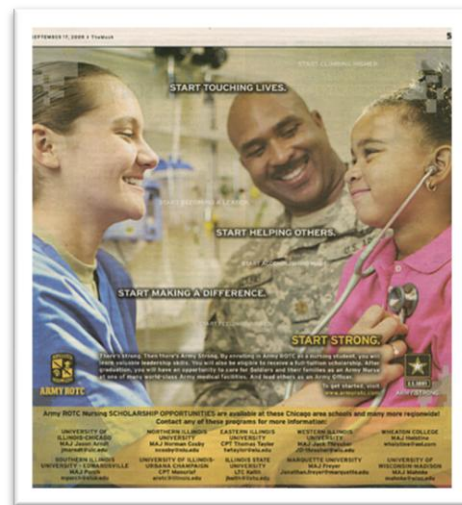
Figure 11: Advertisement for U.S. Army ROTC Depicting Female as Nurse

In contrast to the male-focused ROTC advertisements, the fourth of the series depicts a female. Instead of being faced forward like the others, she is turned to the side, her profile showing a cheery smile. (See Figure 11). She faces a young girl who is smiling back at her. The young girl playfully has the stethoscope in her ears while the adult female has the end of the stethoscope placed over the girl’s heart. Behind the two females, a slightly out-of-focus male looks on and smiles in the direction of what appears to be his daughter.