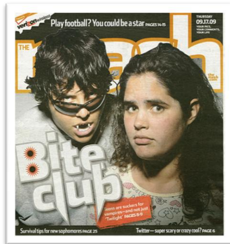
Figure 4: Cover of TheMash Featuring Vampire Article