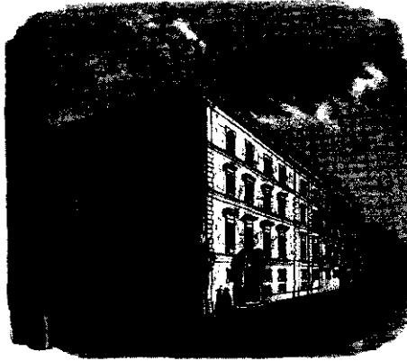
LA MAISON DE MISSION DE ROME, DE MONTE-CITORIO

Monte Citorio, Rome, Italy.