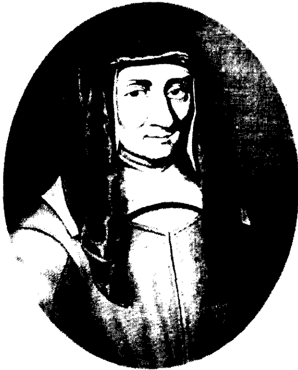
Saint Louise de Marillac

more than thirty years with Louise de Marillac. Together they developed it from reflection on their lived reality, the concrete experiences of the original sisters, and their service of the sick poor. 4