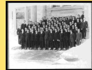
St. Augustine's Literary & Dramatic Society, 1918