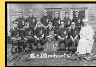
Baseball Team, 1912

St. Norbert College has digitized over 3,000 photos and all ten volumes of the Gartner Diaries. Our collaboration with WHO enables us to provide internet access to these documents. We are currently scanning other college materials for inclusion into this collection of historic Wisconsin resources.